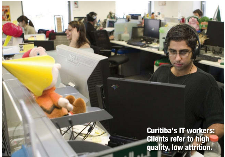
Curitiba's IT workers: Clients refer to high quality, low attrition.

It's one thing for local companies to proclaim they intend to boost software exports and get a