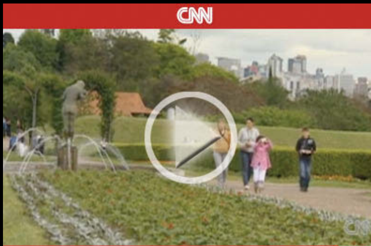
Curitiba: The Green City

“We heard from both the Brazilians and their North American partners that the time overlap with Brazil is more pleasant than the odd hours