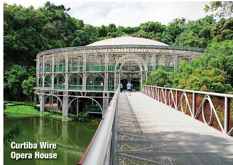
Curitiba Wire Opera House

The time-zone advantage is also a significant attractor. Curitiba Offshore workers are on the job during essentially the same hours as their counterparts in North America and also overlap with much of Europe. The ability to collaborate with outside development partners in real time—to be able to pick up the phone and talk to someone to solve a problem—is proving to be a big benefit of working with IT